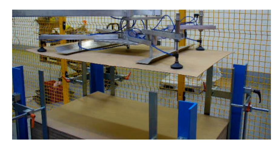
Gripping element with suction cups