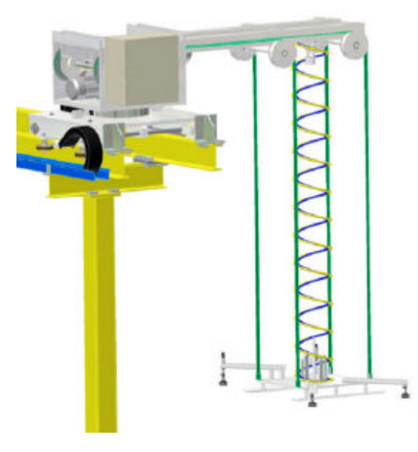
Pallet interleaves warehouse